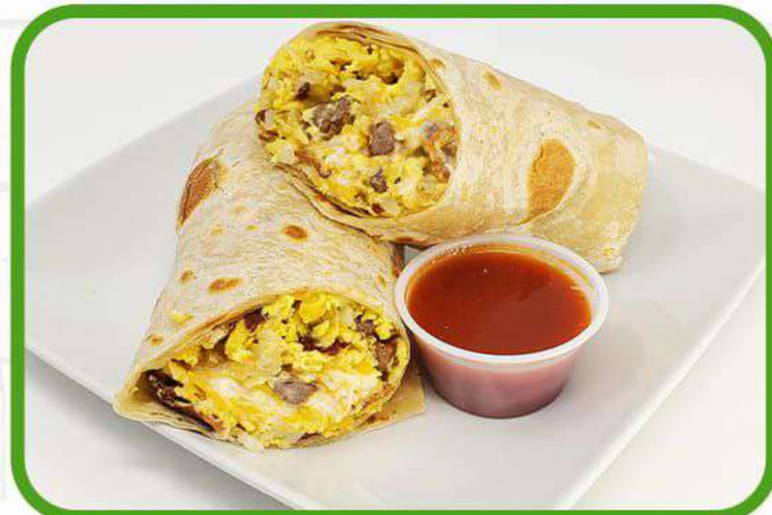
Hash Brown Burrito Eggs, sausage, bacon, hash browns, sour cream & cheese