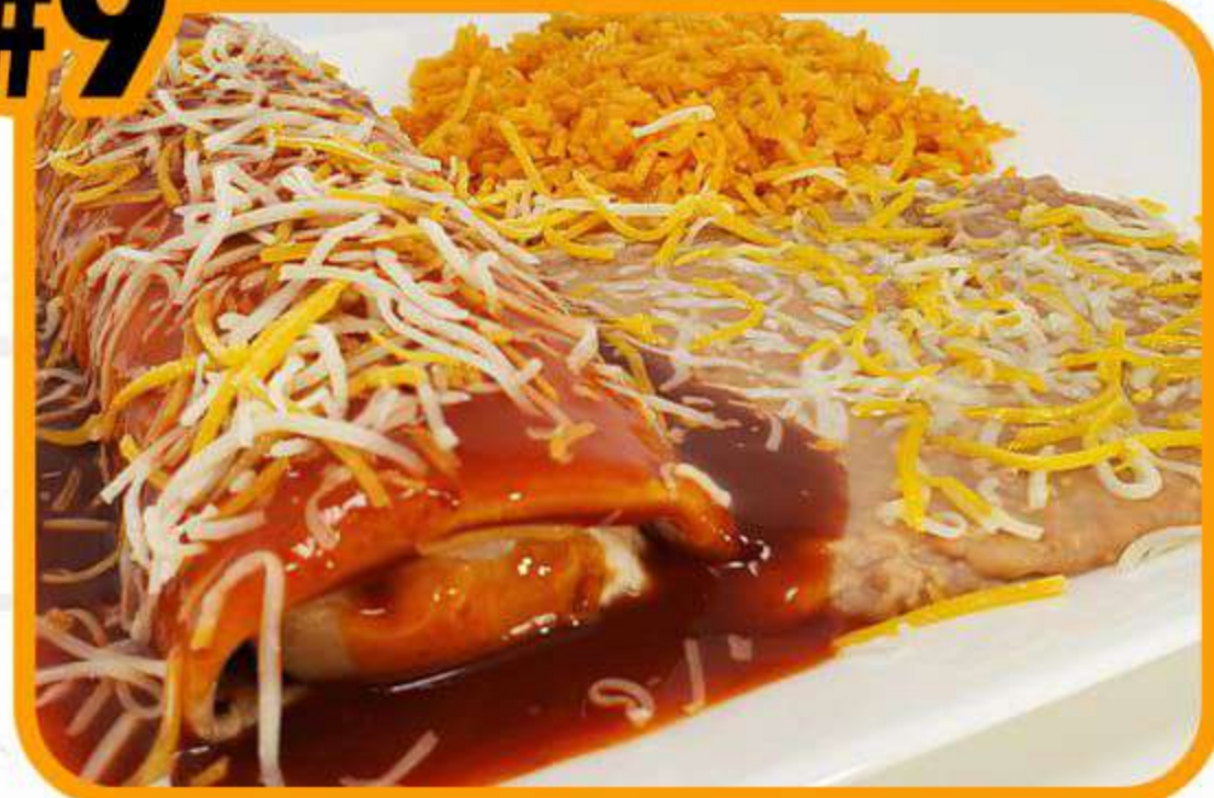
Smothered Burrito Choice of chicken or beef (smothered with special sauce) $10.99