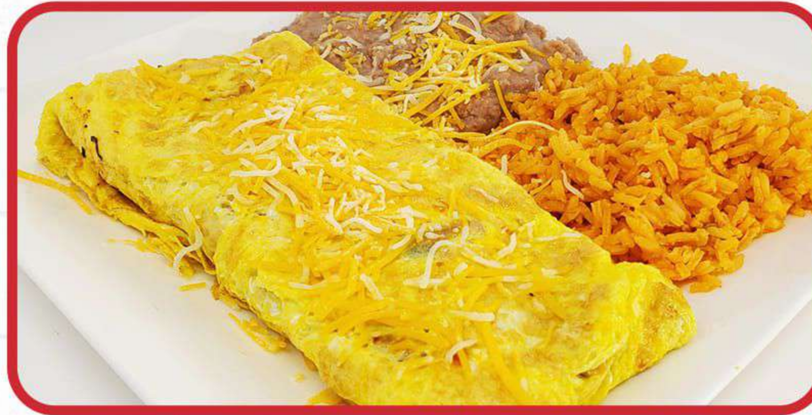
Spanish Omelette Eggs, ham & cheese with pico de gallo