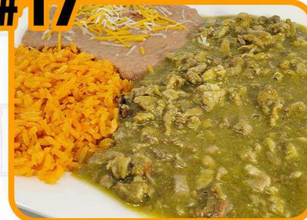
Green Chile Plate Chopped pork & green sauce (with a flour tortilla) $10.99