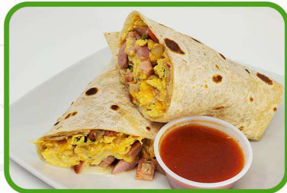
Breakfast Burrito Eggs, ham, pico de gallo, sour cream & cheese