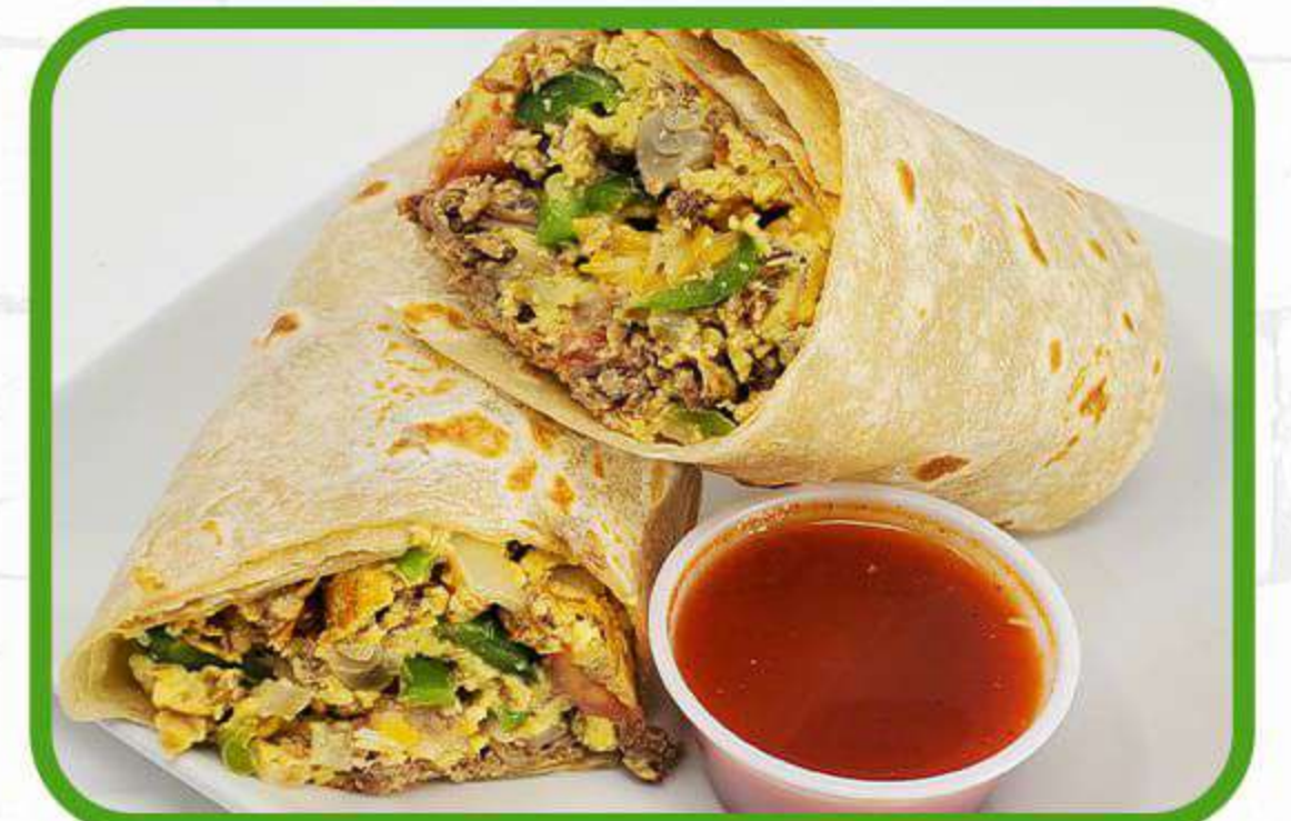
Machaca Burrito Eggs, shredded beef cooked with green pepper, onion, tomato & cheese