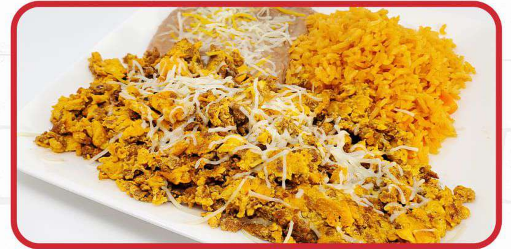
Chorizo Plate Eggs, spiced mexican sausage & cheese.