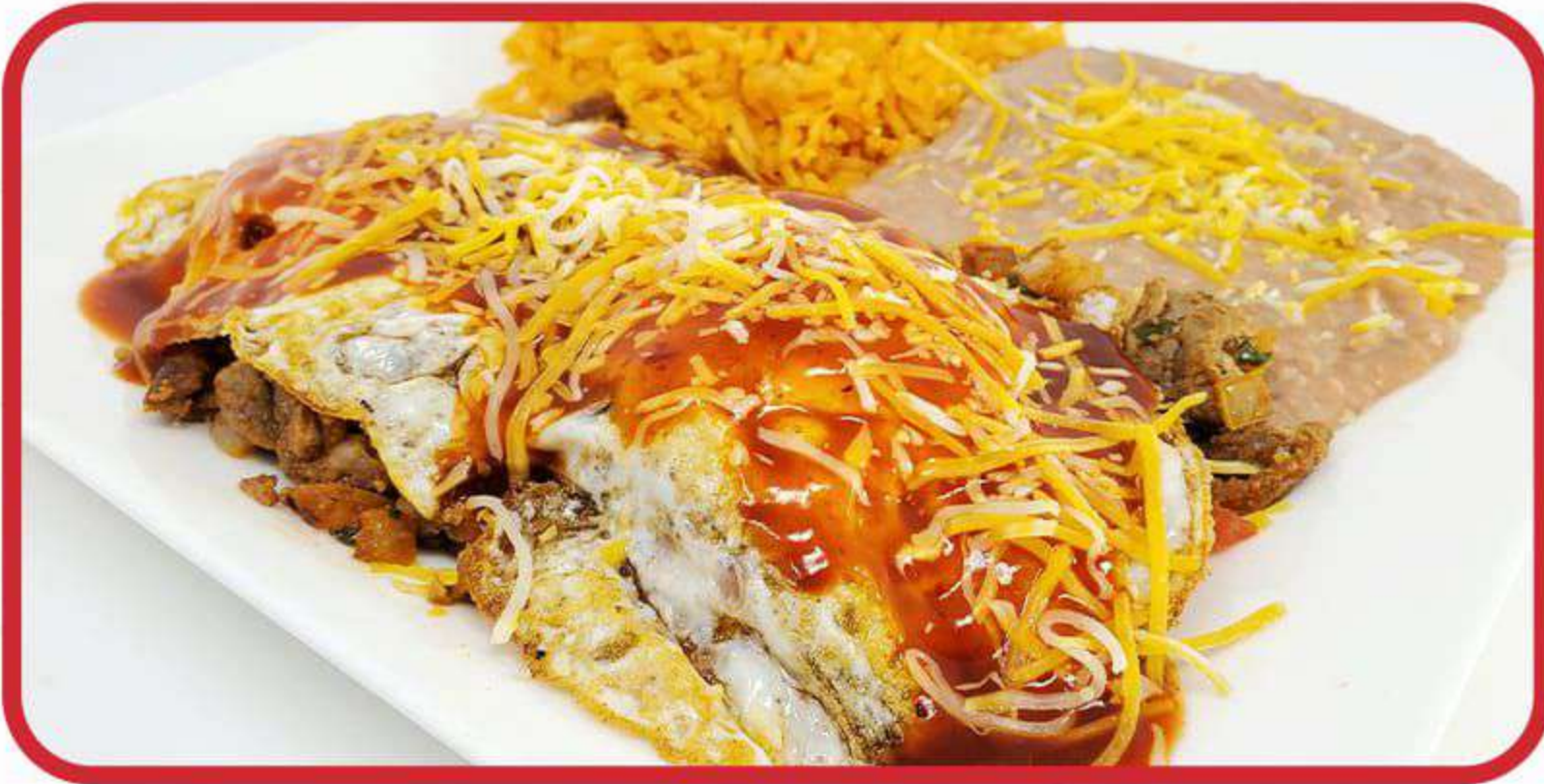
Steak Ranchero Plate Eggs, chopped steak cooked with pico de gallo & cheese with red sauce

Each served with a flour tortilla, beans and rice - all $10.49