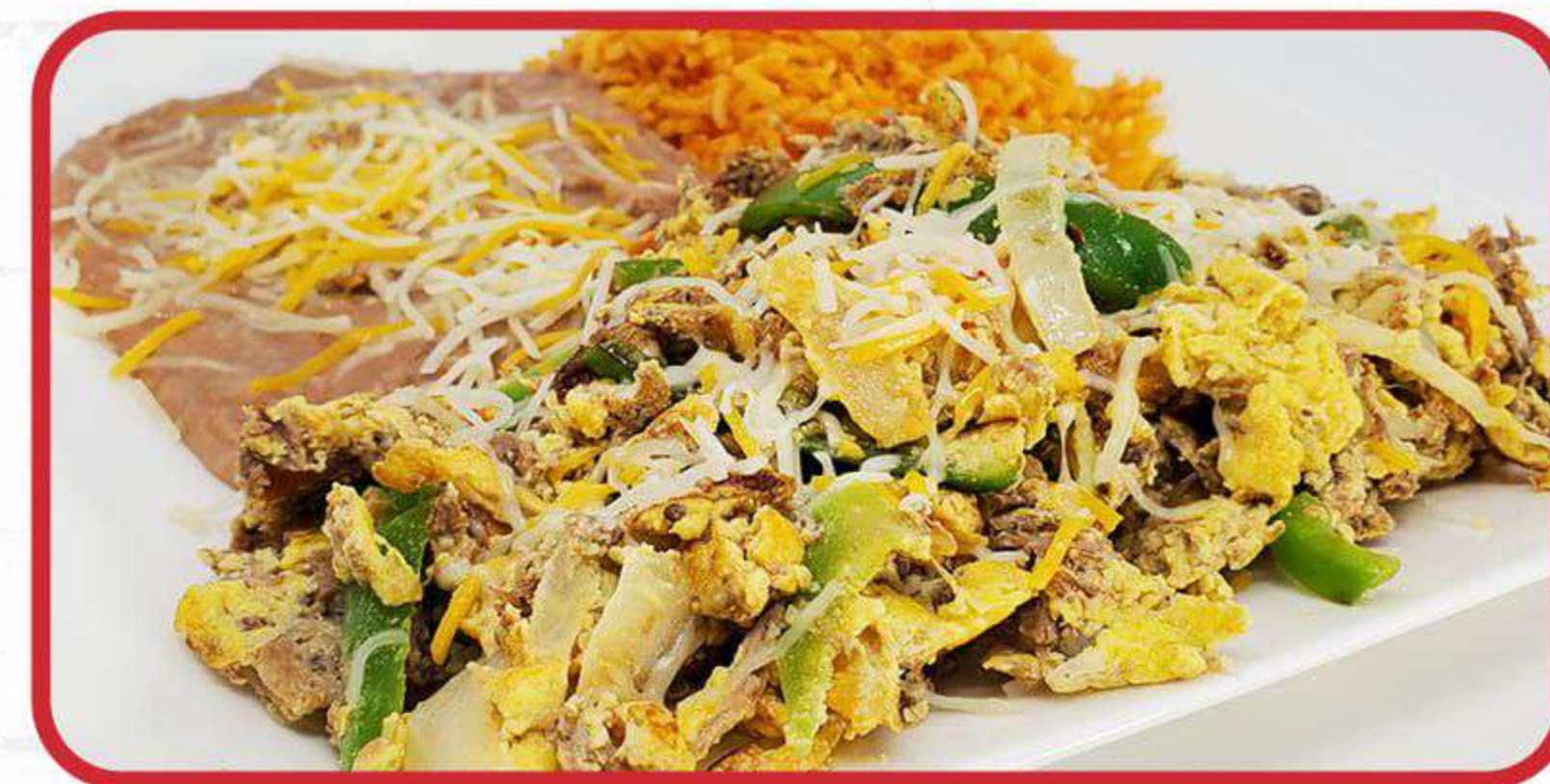
Machaca Plate Eggs, shredded beef cooked with green pepper, onion, tomato & cheese