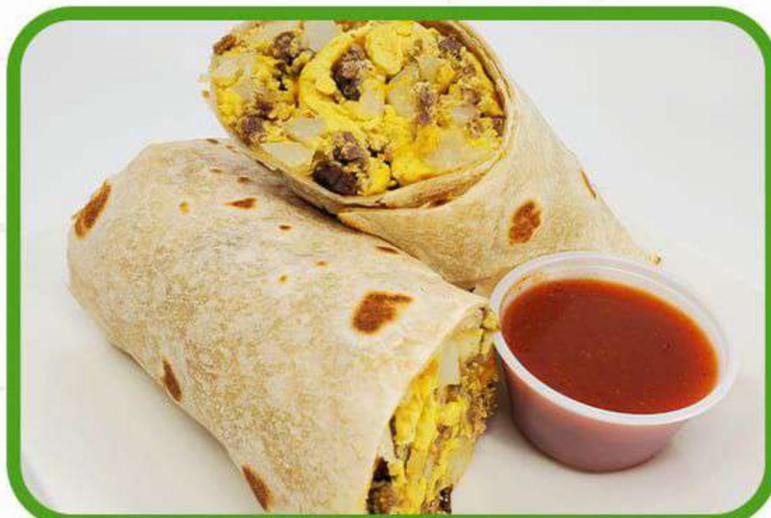
Nebraska Burrito Eggs, chopped steak, potatoes & cheese