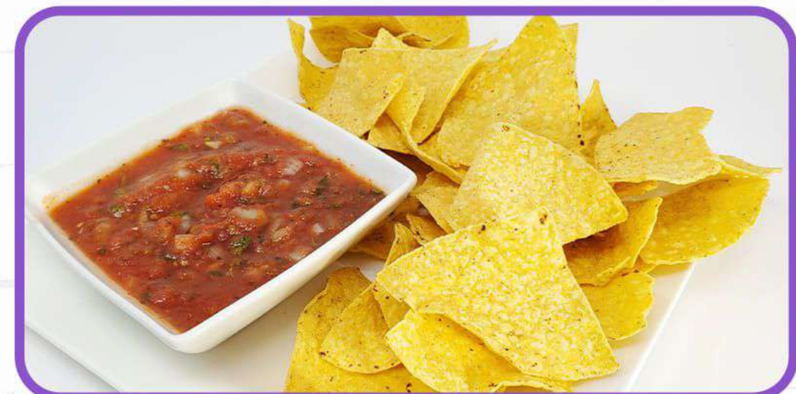
Chips & Salsa