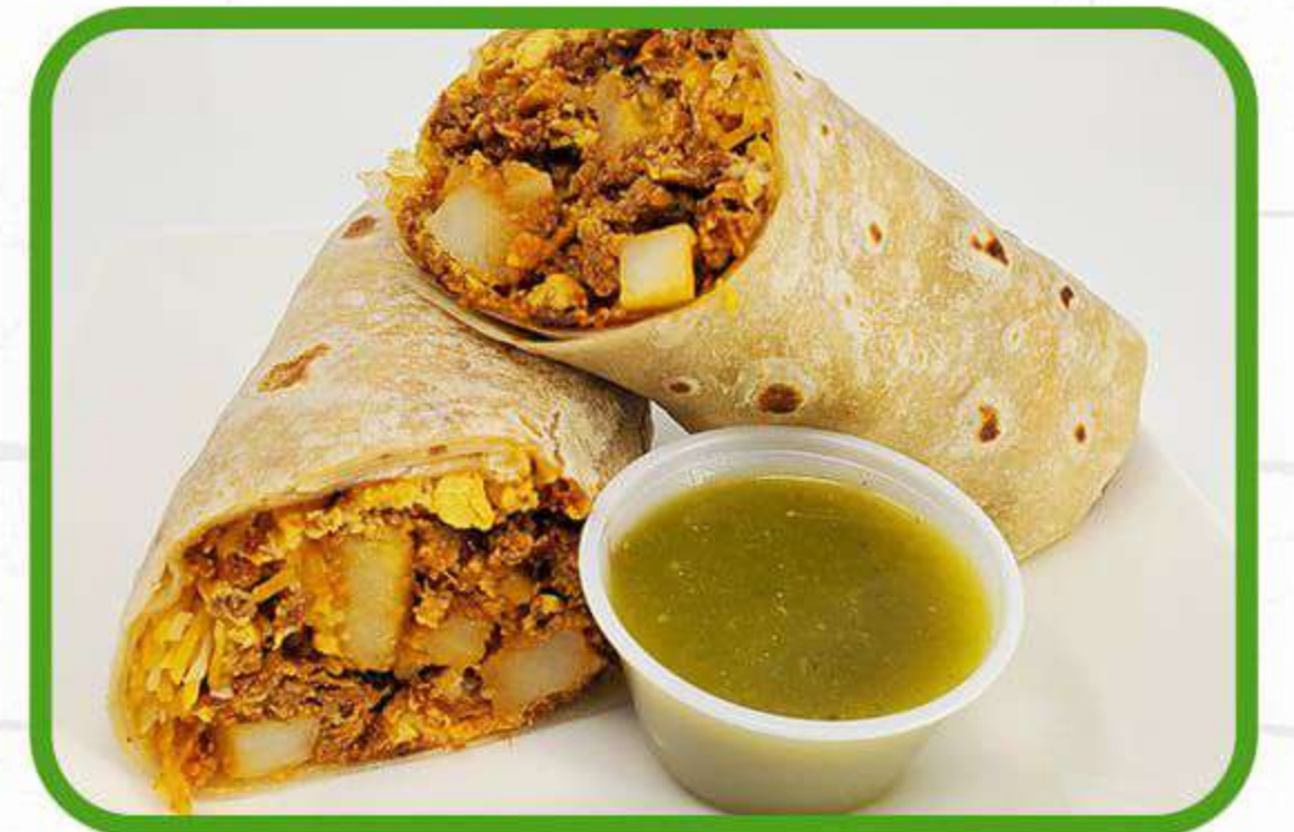
Chorizo Special Burrito Eggs, Mexican sausage, potatoes & cheese