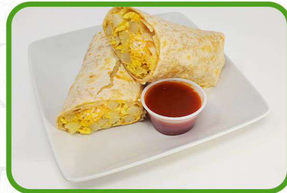
Country Burrito Eggs, potatoes, sour cream & cheese