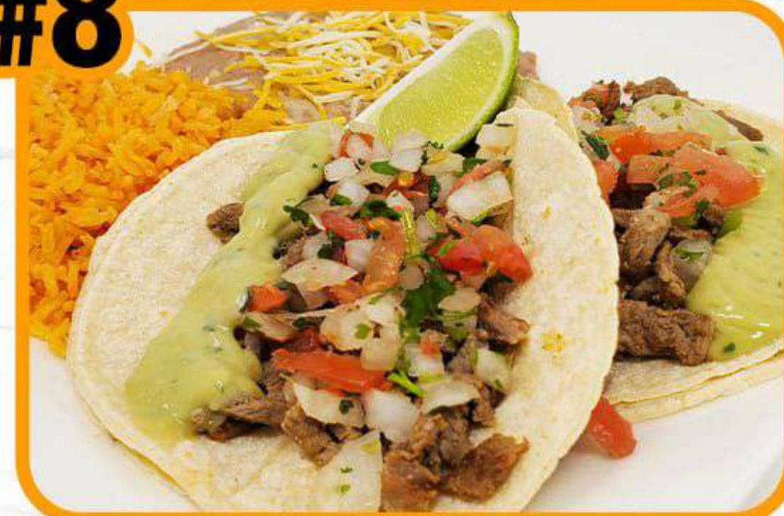
Two Carne Asada Tacos Pico de gallo and guacamole $10.99