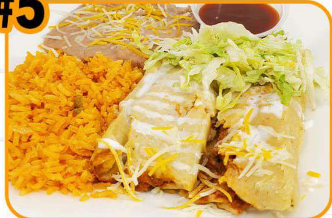
Two Tamales 2 Corn unwrapped pork tamales (with lettuce, sour cream & cheese) $10.49