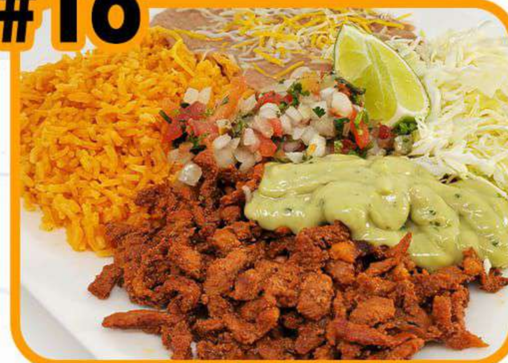
Adobada Plate Pork, marinated in red chile sauce, pico de gallo, guacamole, cabbage, lime (with flour tortilla) $10.99