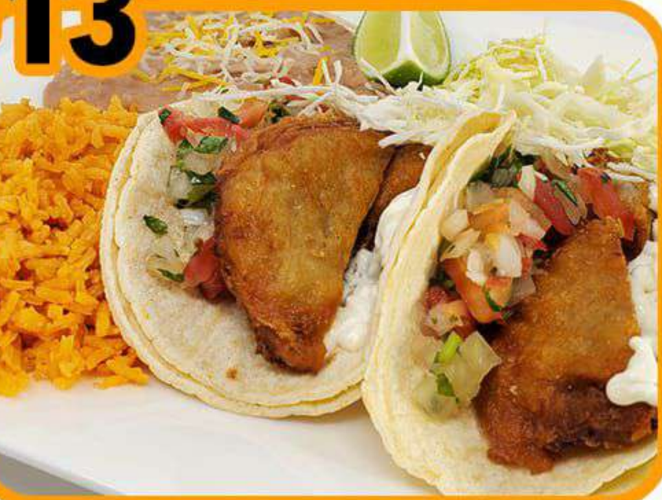
Two Fish Taco Breaded fish fillet with tartar sauce, pico de gallo, cabbage and lime $10.99