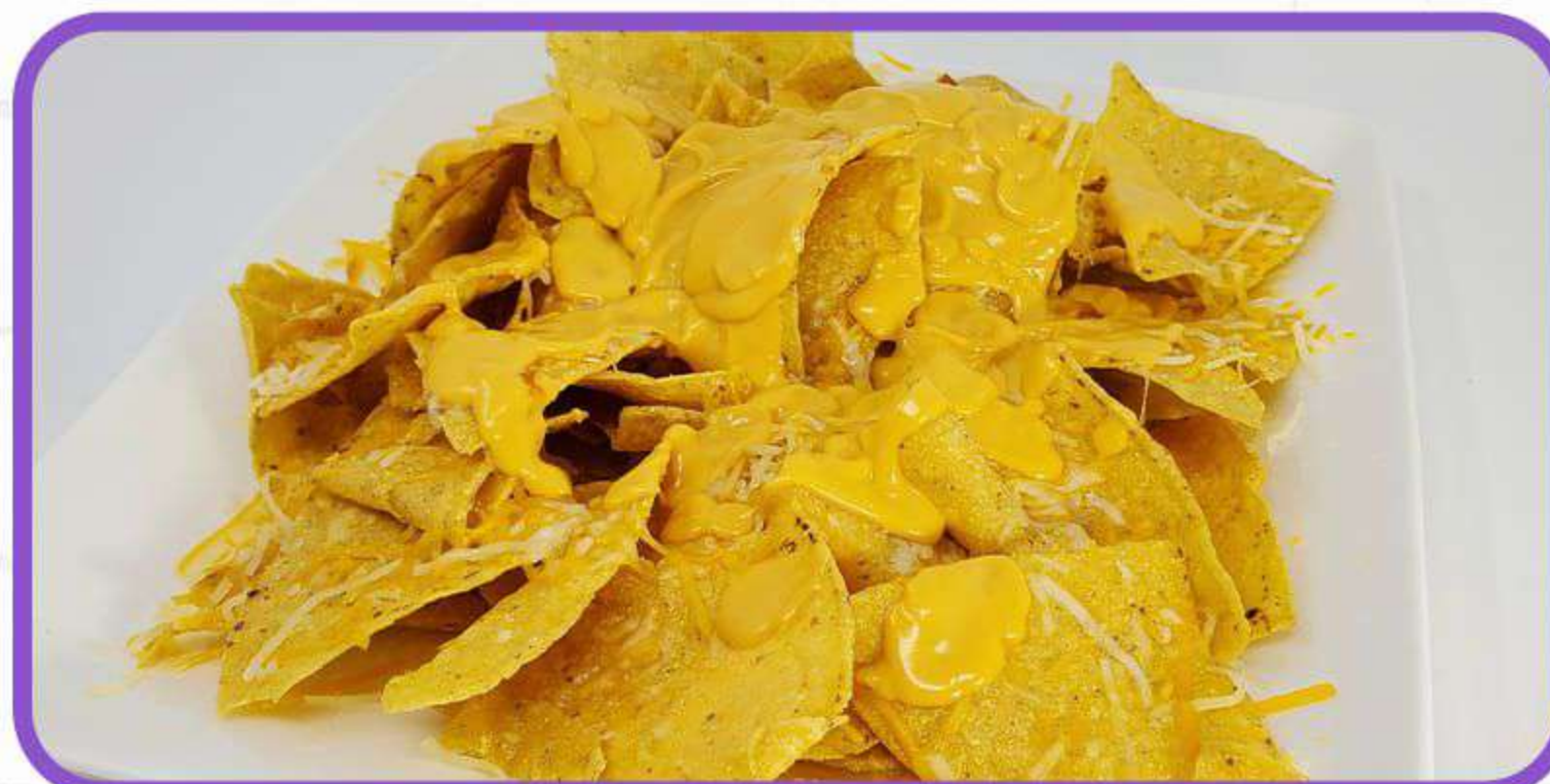
Chips & Cheese