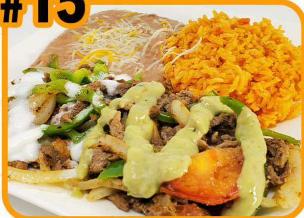
Fajitas Plate Choice of carne asada or grilled chicken (with flour tortilla, sour cream, guacamole & cheese) $11.49