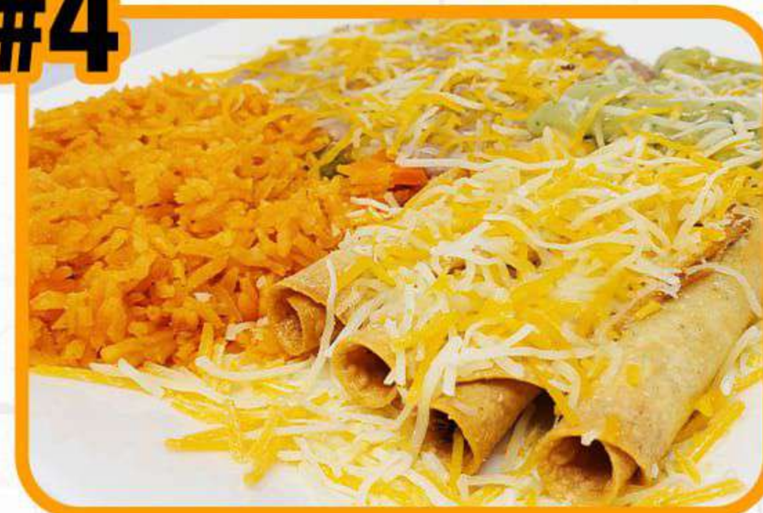
Four Rolled Tacos 4 rolled tacos (with guacamole & cheese) $9.99