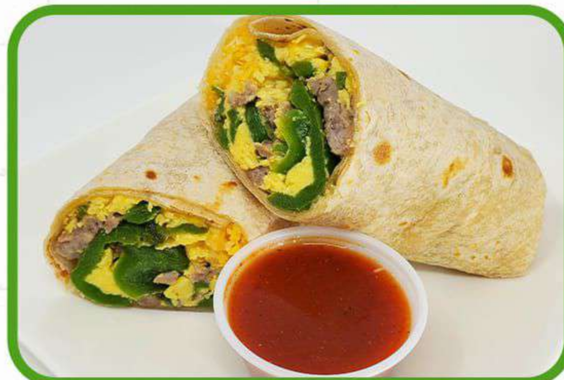
Sausage Burrito Eggs, sausage, green peppers & cheese