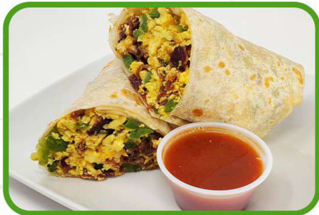
Bacon Burrito Eggs, crispy bacon, green peppers & cheese

All Day Breakfast Burrito $8.49 Turn it into a combo for $2.99