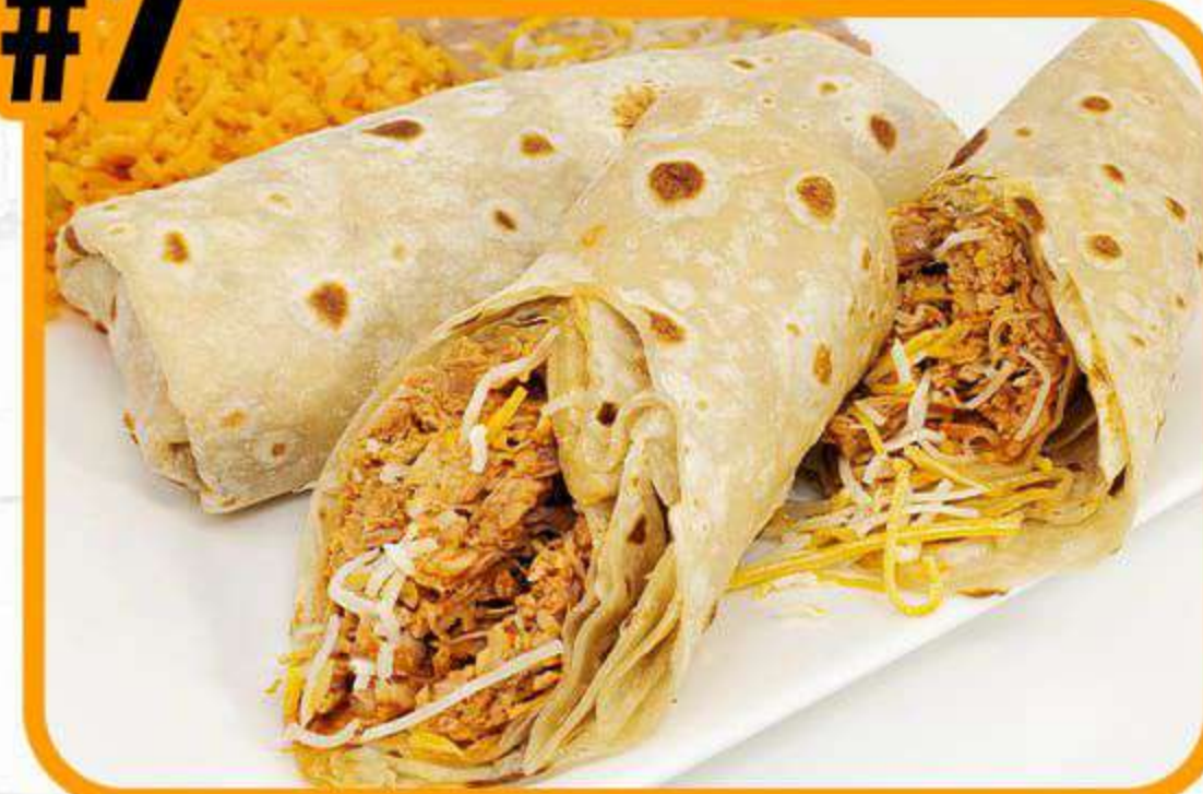
Two Burritos Choice of beef or chicken $11.49