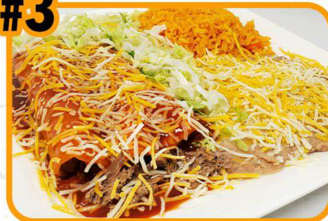
Two Enchiladas Choice of beef, chicken or cheese (with lettuce & cheese) $9.99