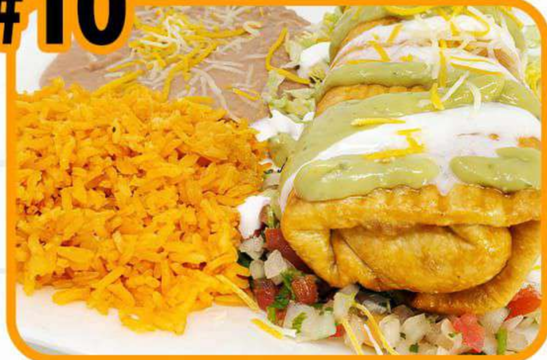
Chimichanga Choice of beef or chicken (with sour cream, guacamole, pico de gallo, lettuce & cheese) $10.99