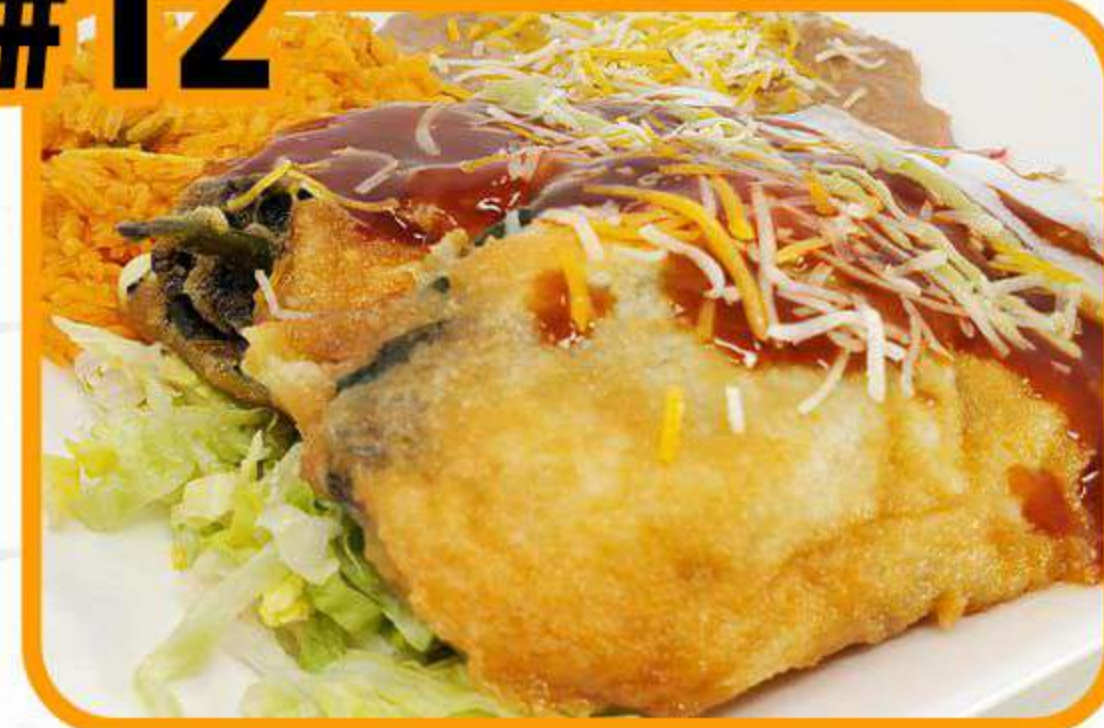
Two Chile Rellenos Stuffed cheese, fried pepper, sour cream, picode gallo, guacamole, lettuce & cheese $10.99