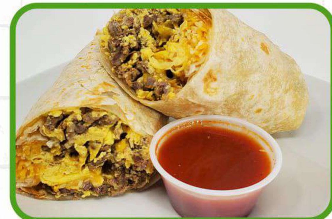
Steak and Egg Burrito Eggs, chopped steak & cheese