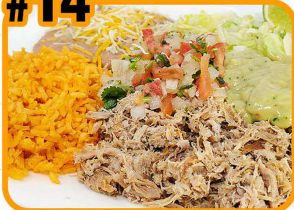
Carnitas Plate Roasted Shredded pork or carne asada (with flour tortilla, pico de gallo, lettuce, guacamole & cheese) $10.99