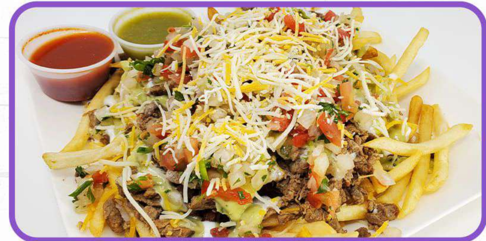
Super Fries Carne asada, pico de gallo, guacamole, sour cream and cheese