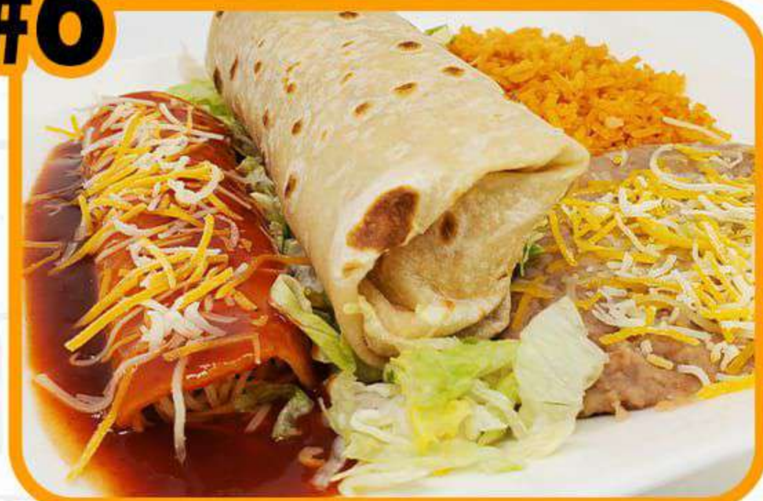
Burrito & Enchilada Choice of beef or chicken burrito & cheese enchilada $10.49