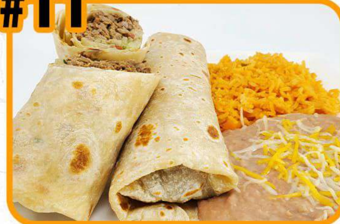
Two Deluxe Burritos Choice of carne asada or grilled chicken $13.49