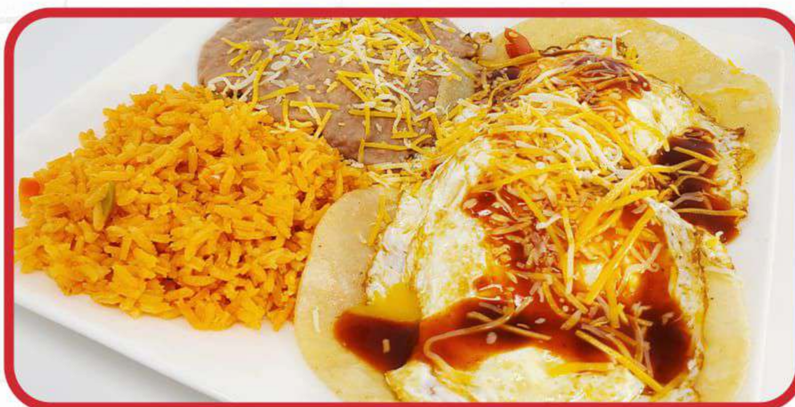
Huevos Rancheros Plate Eggs, pico de gallo & cheese with red sauce