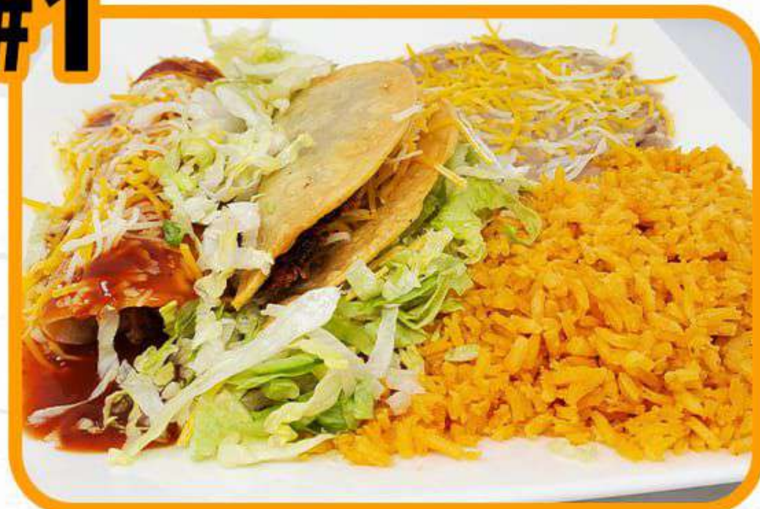
Taco & Enchilada Beef taco & cheese enchilada $9.99