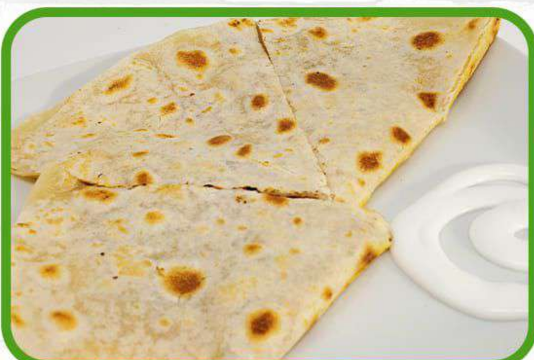
# 1 Kid's Quesadilla Cheese and diced ham stuffed into a flour tortilla $6.49