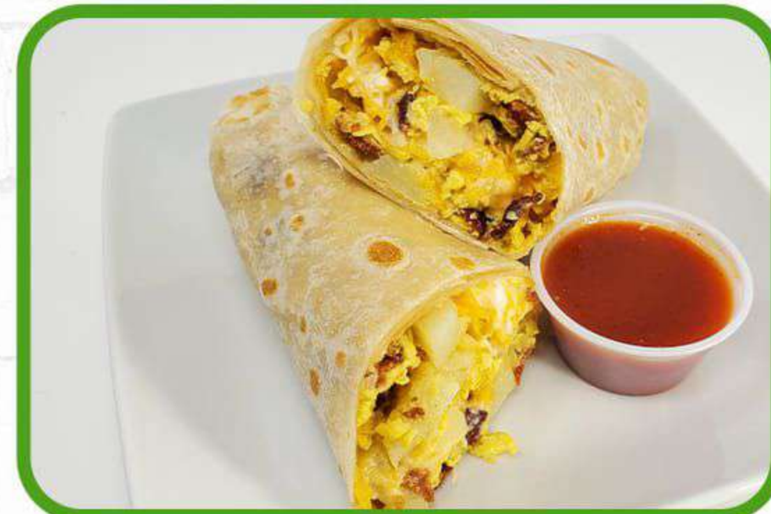
Lincoln Burrito Eggs, bacon, potatoes, sour cream & cheese