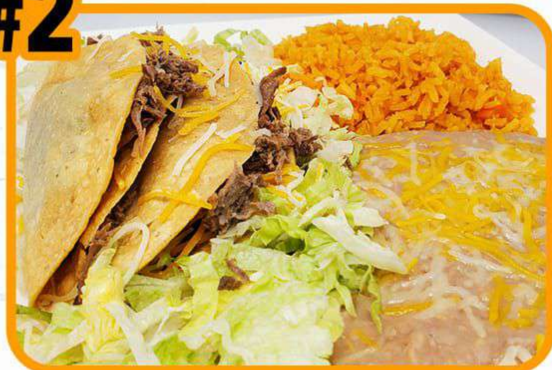
Two Tacos Choice of beef or chicken (with lettuce & cheese) $9.99