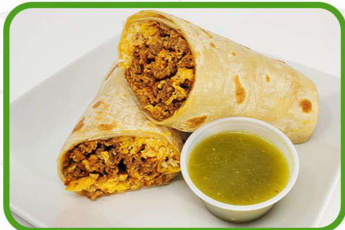
Chorizo Burrito Eggs, spiced Mexican sausage & cheese