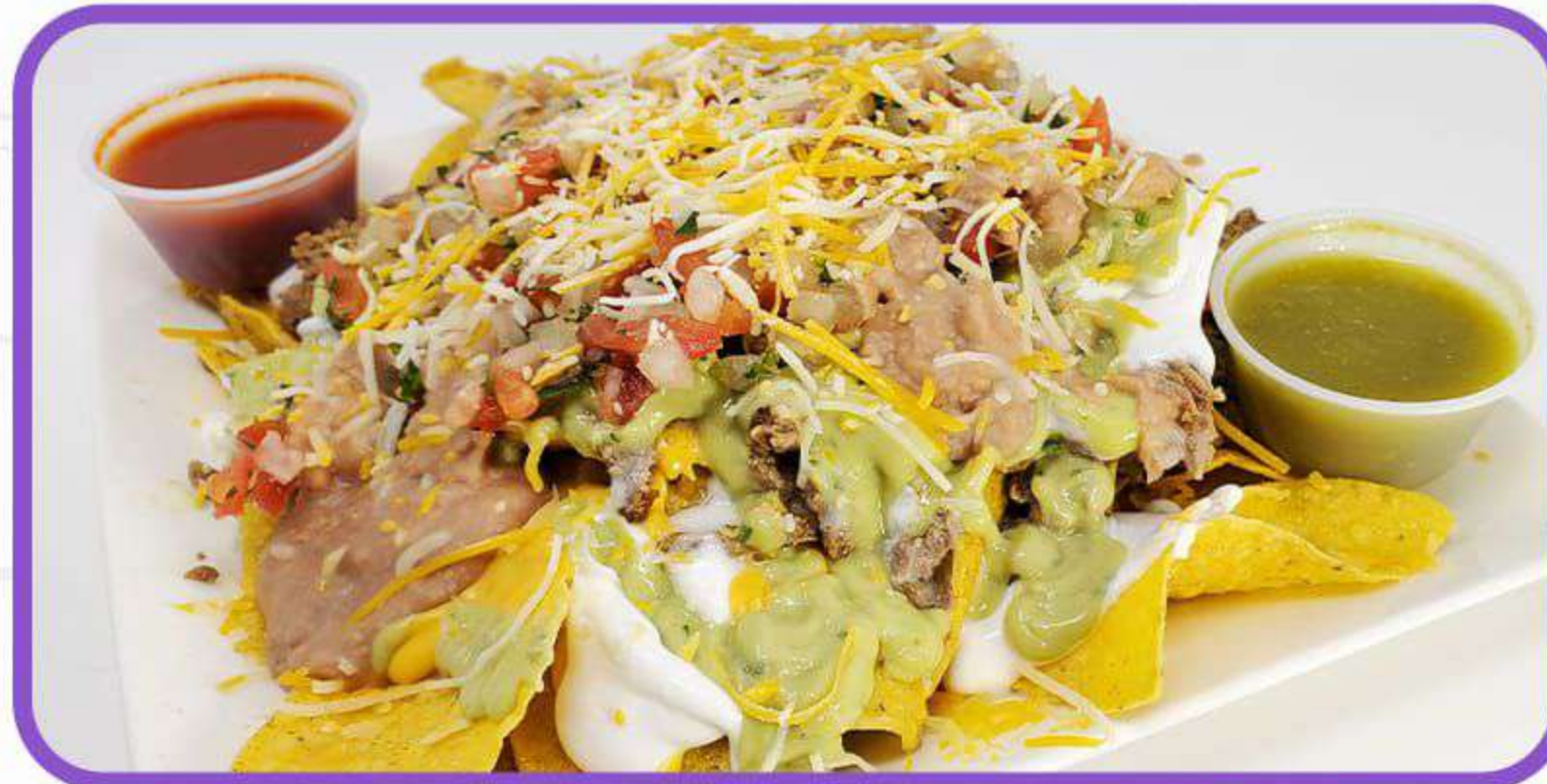
Super Nachos Carne asada topped with beans, cheese, sour cream, guacamole and pico de gallo