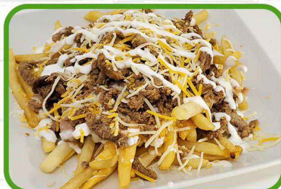
# 3 Junior Fries Kid's fries with chicken or steak, sour cream, beans and cheese. $6.49